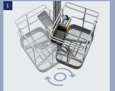
Basket: can be rotated left and right at an Angle of 140°