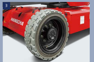
Tires: foam-filled tires with good off-road performance