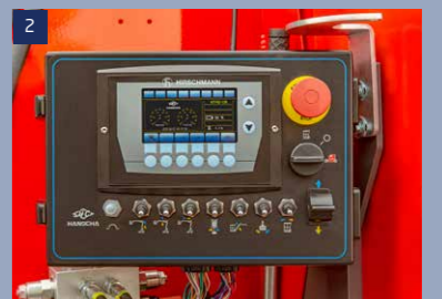
Base control box: the control box can be used to control each action of the device, easy to understand