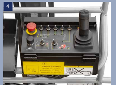
Basket control box: each action of the device can be controlled through the control box to quickly reach the working area, and the control is simple and easy to understand