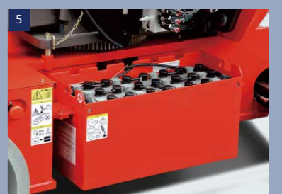
Standard tracking battery: Reduce 40% of the charge time, raise 50% of the life time