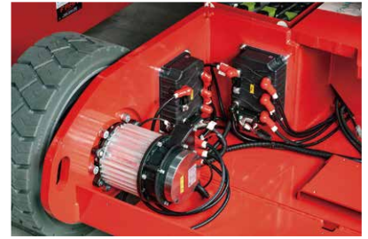
Permanent magnet drive (Standard)